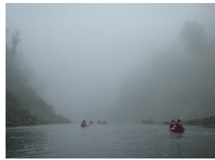
Duke of Edinburgh trip down the Whanganui River