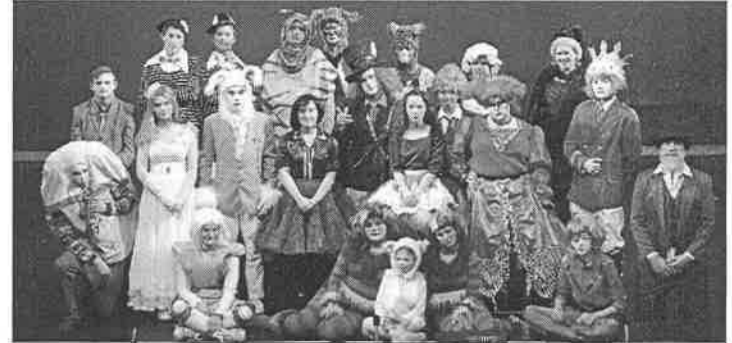
Relive the splendour of